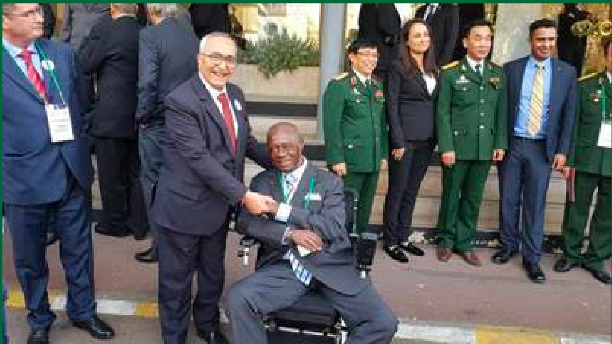
The Chair SCAA together with the WVF Deputy President.

On this occasion, open days were organized on June 28 and 29, 2022 at the Maison du Combattant in Yaoundé. During this mini exhibition-sale fair, the widows and orphans of soldiers opened up to the public of Yaoundé, the capital city and its surroundings, to show their creative genius as well as their know-how by presenting their artisanal creations and food products from their farms. Through this activity, they showed their firm desire to invest more in the empowerment process in place at ONACAM.