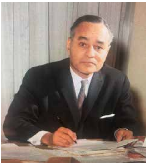
Ralph Bunche Nobel Peace Prize, 1950

“None can speak more eloquently for peace than those who have fought in war. The voices of war veterans are a reflection of the longing for peace of people the world over, who within a generation have twice suffered the unspeakable catastrophe of world war. Humanity has earned the right to peace. Without it, there can be no hope for the future. And without hope, man is lost. The voice of the people must be heeded. They aspire to a richer life in freedom, equality and dignity, as in things material; they pray for peace. Their will for peace and a better life can be, must be, crystallized into an irresistible force against war, aggression and degradation. The people have had to work and sacrifice for wars. They will work more willingly for peace. Let there be a dedicated effort, a greater crusade than history has ever known, for a world of peace, freedom and equality.”