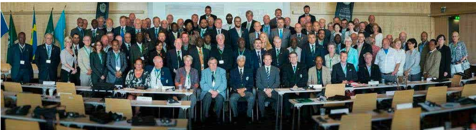
WORLD VETERANS FEDERATION PEACE AND SECURITY SUMMIT Stockholm (Sweden), 28-30 May 2013

“Veterans have experienced the horrors of war and have to live with the consequences for the rest of their lives. They deserve help, support and recognition from their society. On the basis of this understanding, the Peace and Security Summit in Stockholm opened a new dimension in the discussion of veteran affairs. Veterans can give a lot to their societies having served under severe circumstances worldwide and demonstrated skills that can be of benefit to all parts of their societies. The Summit demands that the countries represented within the WVF and the international community exploit and make best use of these experiences and capabilities, which should come to bear to prevent the use of force, during conflict and thereafter. Veterans should also be involved to prevent ethnic crises and in support of integration processes within their societies. The message of the veterans, voiced individually, through their organisations or the WVF should be listened to in all crisis situations.”